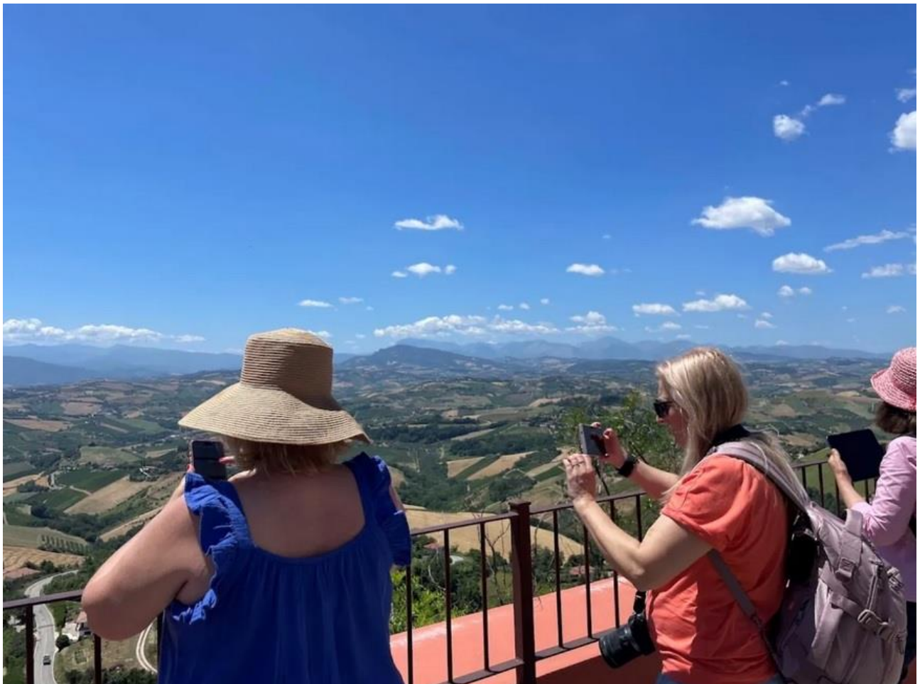
The view from Ripatransone was amazing with the mountains rising above the landscapes