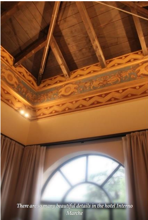
There are so many beautiful details in the hotel Interno Marche