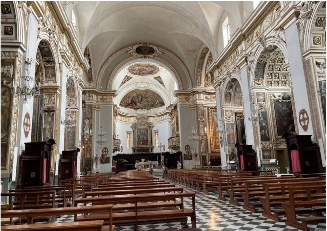
Church of St Benedict in Fabriano

You should definitely take a guided tour and if you are lucky you can see a piece of the oldest part behind the altar in the oldest part of the church. Fabriano was one of the first towns to produce paper and is still famous for the invention of the watermark, the technique used by most banknote manufacturers.