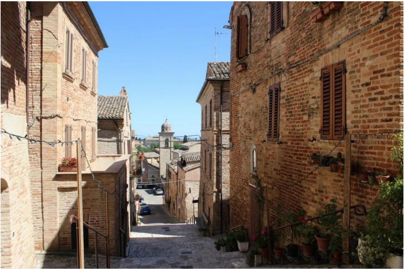
Ripatransone is suitable for a small stop on the road