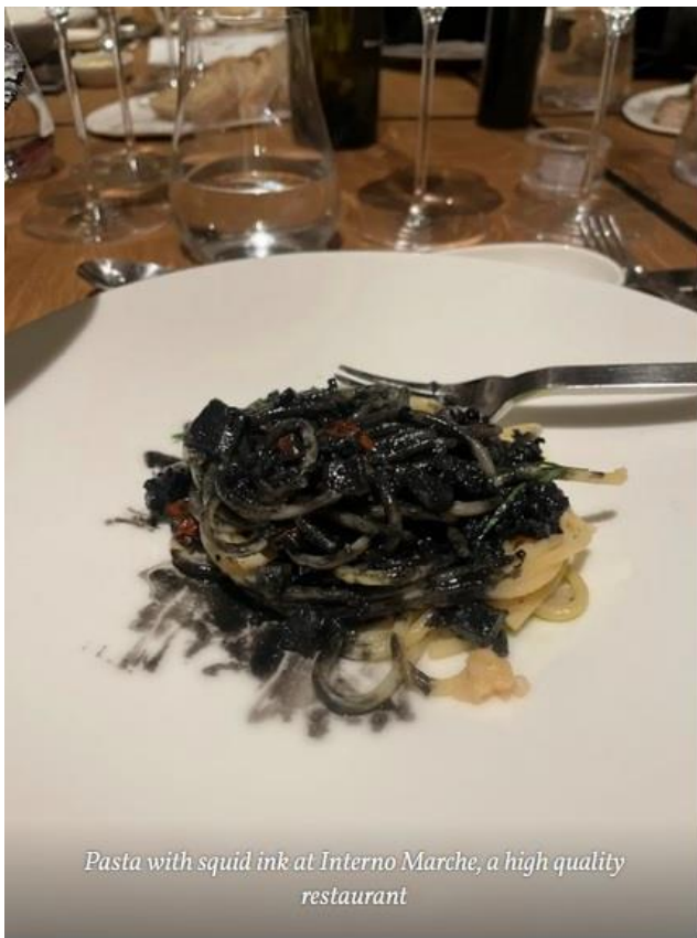
Pasta with squid ink at Interno Marche, a high quality restaurant