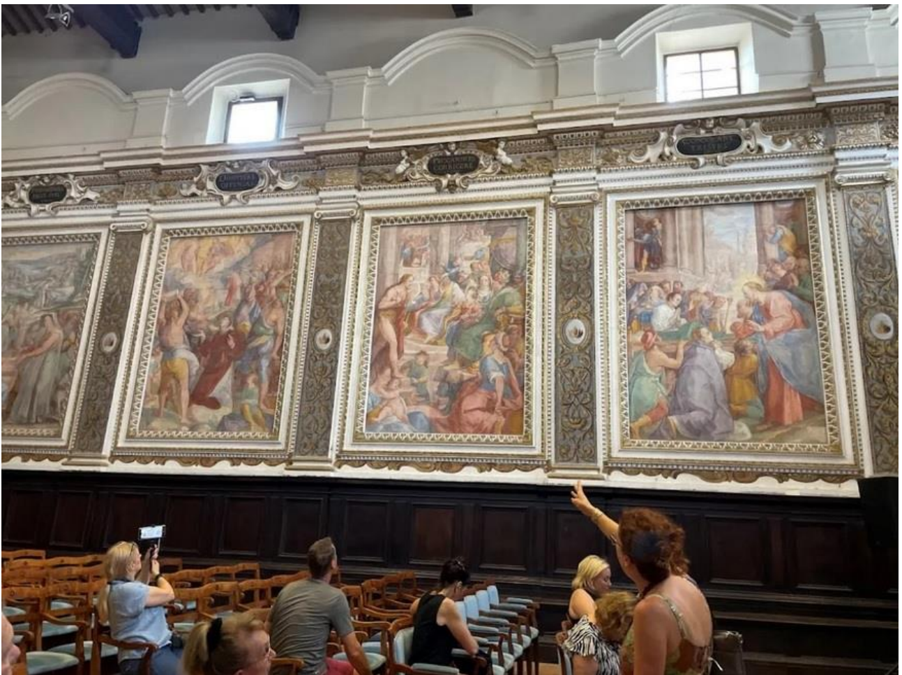
Oratorio della Carità in Fabriano with beautiful paintings with many stories