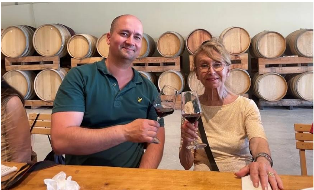
There is also the possibility to have a wine tasting inside the wines stored at Guerrieri

The grapes Bianchetto, Verdicchio, Chardonnay, Sauvignon, Moscato, Sangiovese, Montepulciano, Lacrima, Cabernet Sauvignon and Merlot are grown here on 57 hectares. Guerrieri has received awards for its wines and you can buy all of them on site, both bottles and larger boxes. Their wines are not available in the systembolaget, but many other wines from Marche are available to try if you want to get a flavour of the region.