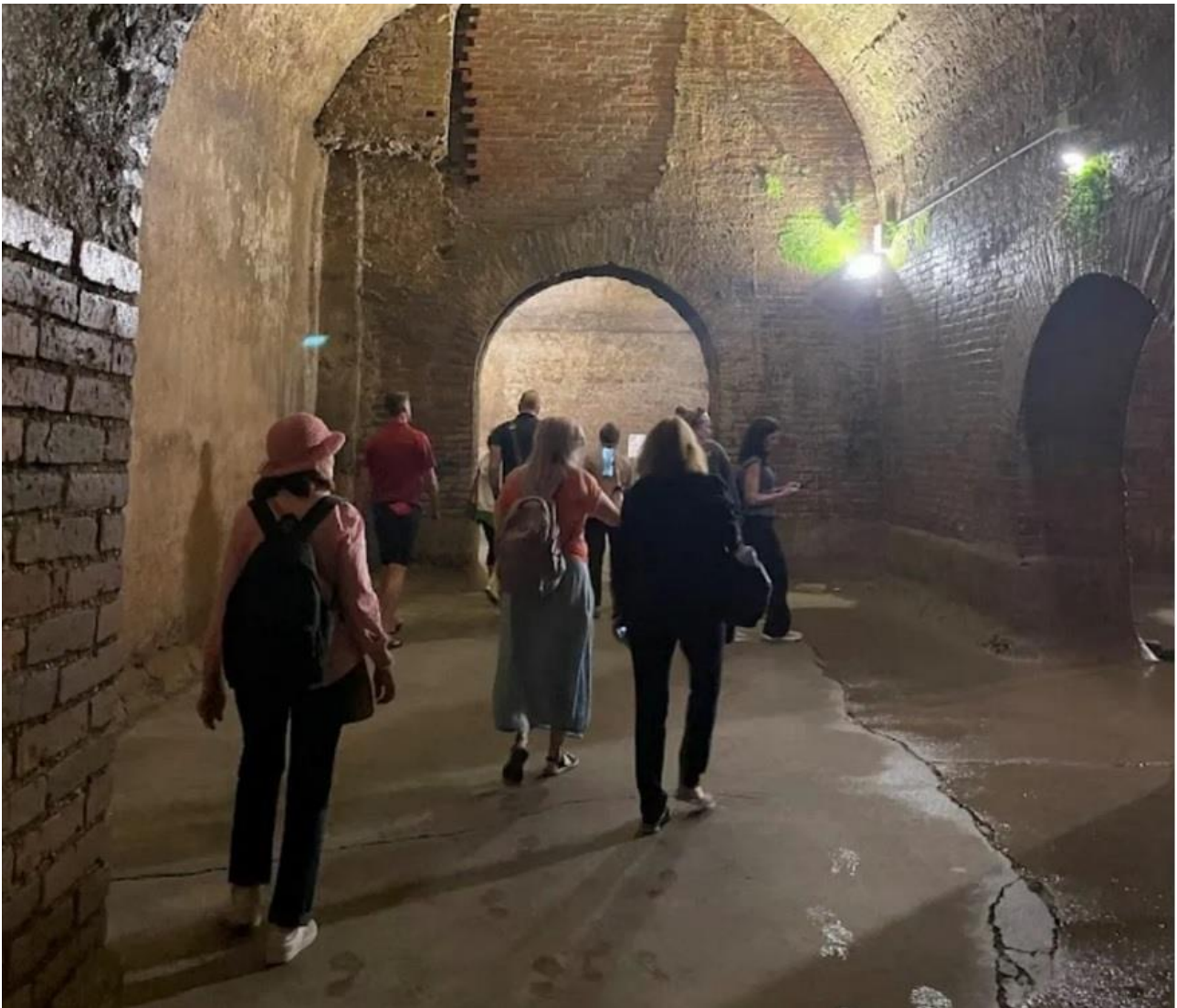
The 2000-year-old Roman cisterns of Fermo provide a nice coolness.