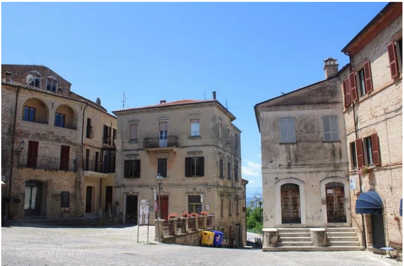
Ripatransone in Marche. You sometimes forget that when it's siesta time, everything is closed and the streets are empty.