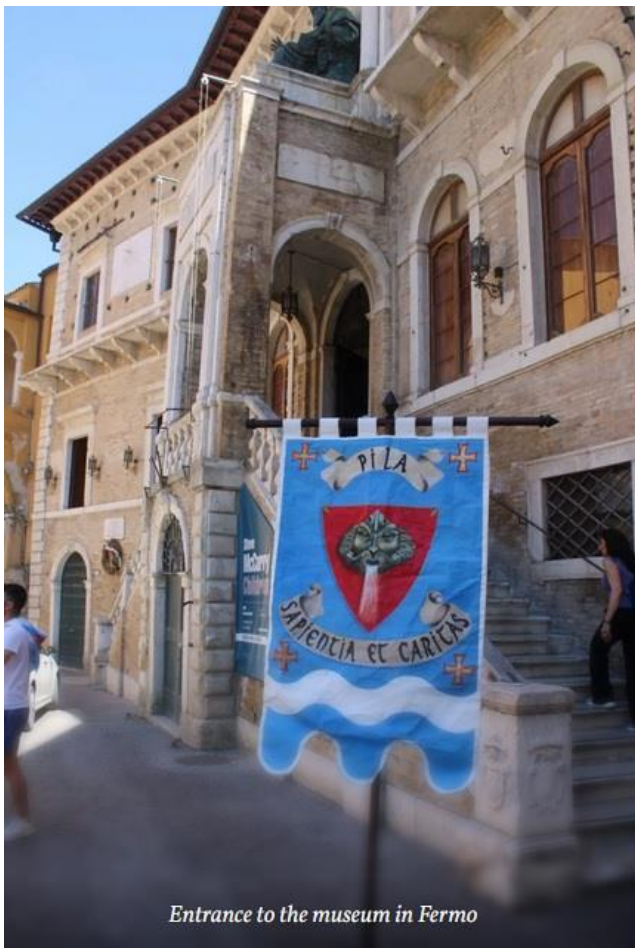
Entrance to the museum in Fermo