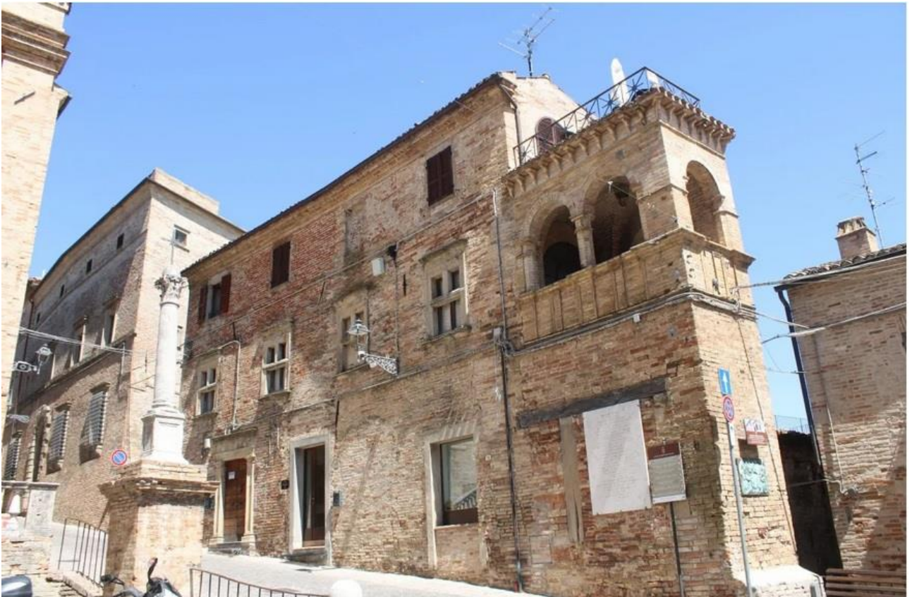
Some of the older buildings in Ripatransone

There is also a wine bar, Ripani, which has a good wine list and simple dishes, perfect for a little wine tasting.