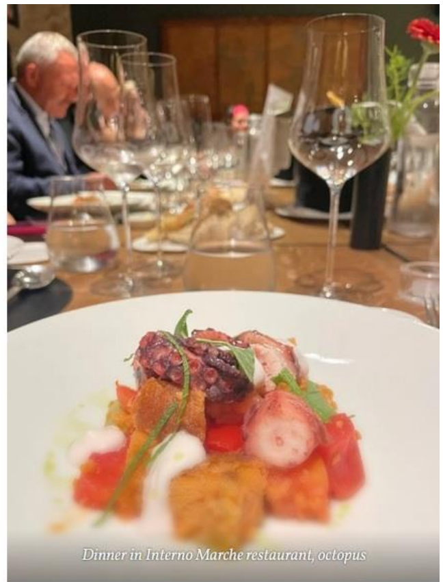
Dinner in Interno Marche restaurant, octopus