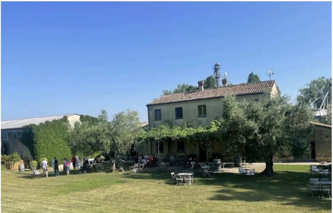
Guerrieri's vineyard is surrounded by cooling trees above the outdoor wine tasting area

The region is teeming with vineyards (read more here: Italian wines and caves in the Marche region ) but this was certainly a place you can stay for a long time and they have a nice garden to taste the wines in. This family-run farm started operations in the 1800s and it is now the fifth generation to take care of the property.