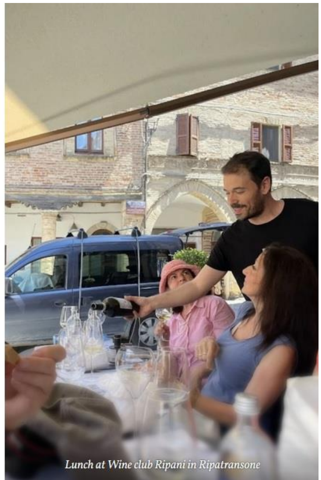
Lunch at Wine club Ripani in Ripatransone