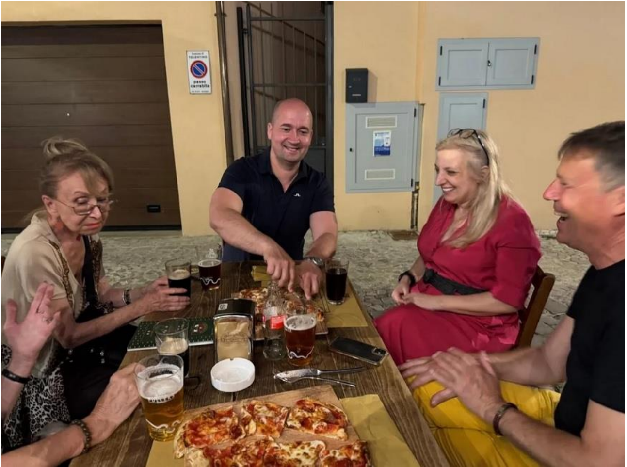
Italian craft beer and pizza in Tolentino

The last evening was spent in the small town of Tolentino and at the hotel Interno Marche. We travelled around together and experienced so much wine and pasta that we decided to try some Italian craft beer and a real Italian pizza.