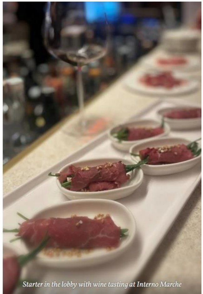
Starter in the lobby with wine tasting at Interno Marche