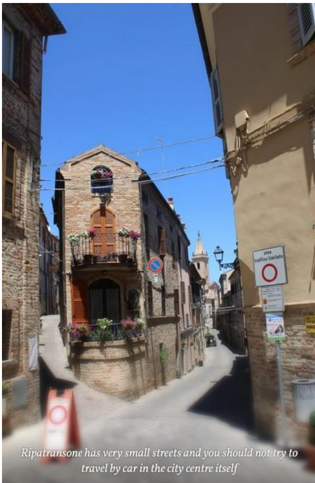
Ripatransone has very small streets and you should not try to travel by car in the city centre itself